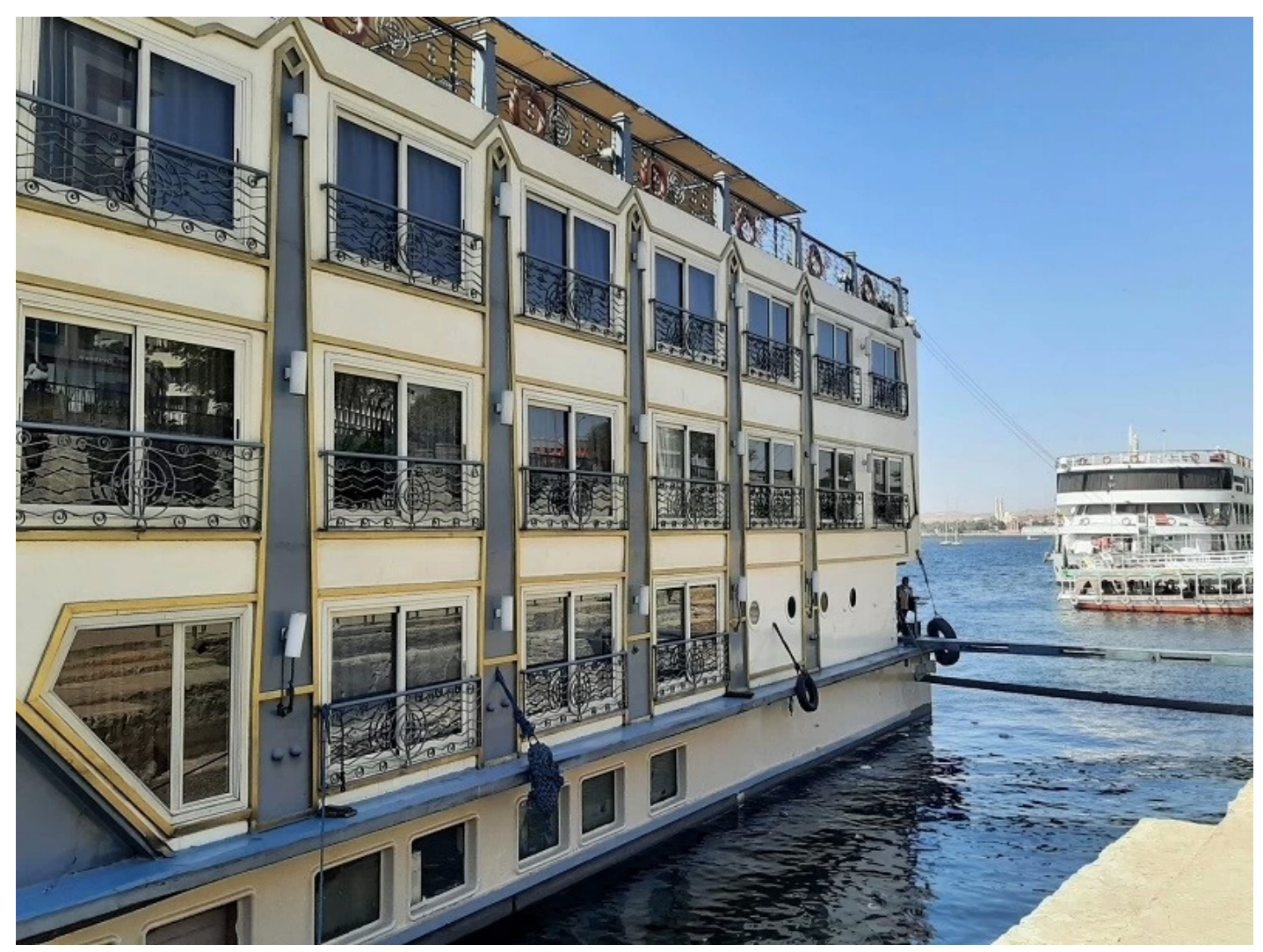
Top 4 Nights Luxor and Aswan Nile Cruise